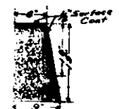
SECTION OF CURB Scale 1/2"