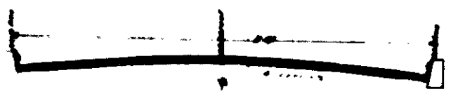
SECTION OF PAVEMENT A-A Scale 1/2"